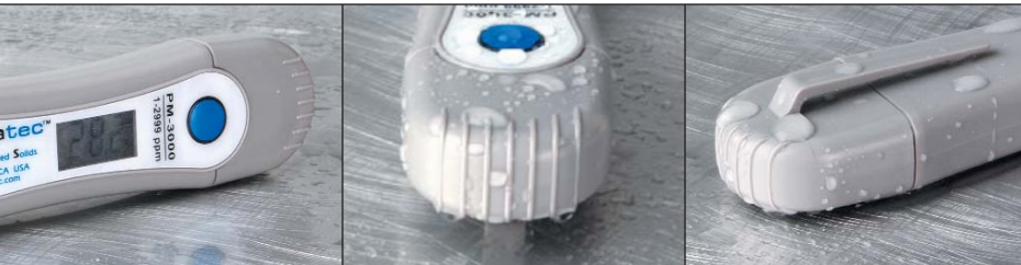
LARGE LCD DISPLAY