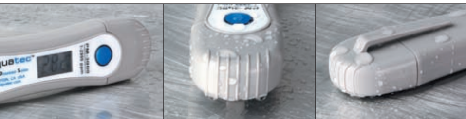
LARGE LCD DISPLAY